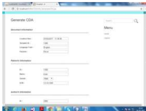
Figure 4. Generation of CDA

In this login page we provide an interface for login into the cloud, where we can get the entire details of the end user using proper login credentials and further accessing of information .