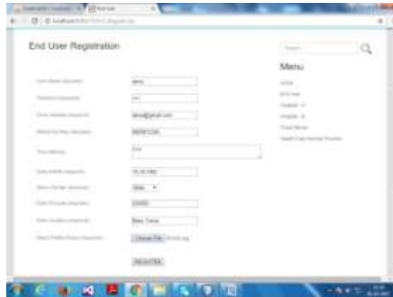
Figure 2. End user Registration

This is an API where end user get registered for proper authentication to utilize the different hospitals information.